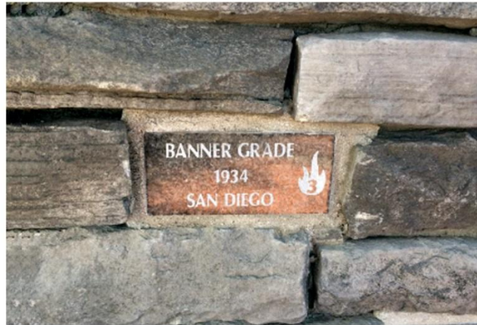
Banner Grade Fire inscription at the California Wildland Firefighter Memorial This memorial is located at the summit of State Route 74 in Orange County, California