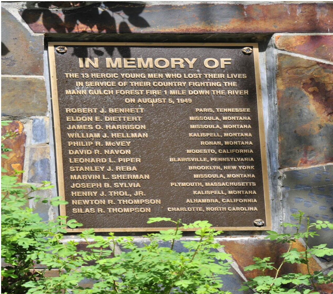
Memorial at Meriweather Picnic Area on the Missouri River in Montana.