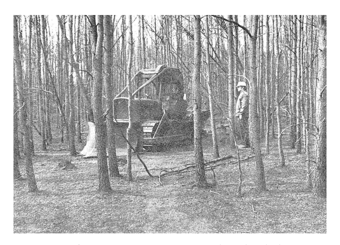
Photo of the burned over tractor plow taken during the investigation