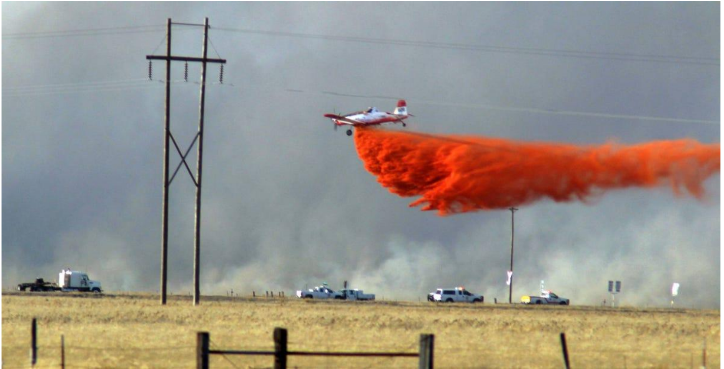
Single engine air tanker drop on the East Amarillo Complex