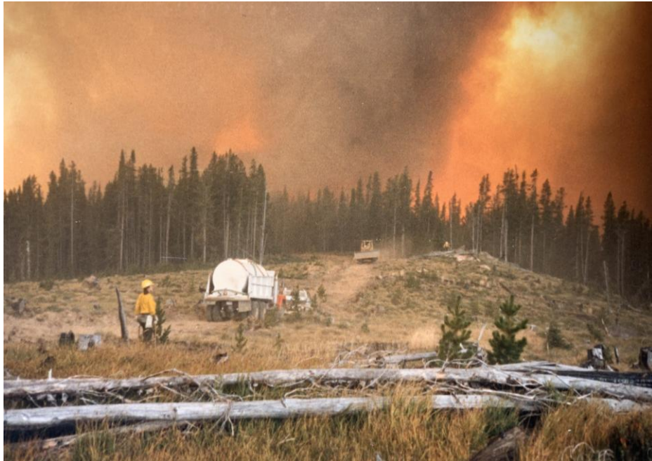
Firefighter watches as a Strike Team Leader walks a D6 bulldozer and operator into their safety zone just minutes before the fire burned through the clearcut. Flame lengths were estimated to be more than 150' as the flaming front reached the safety zone.