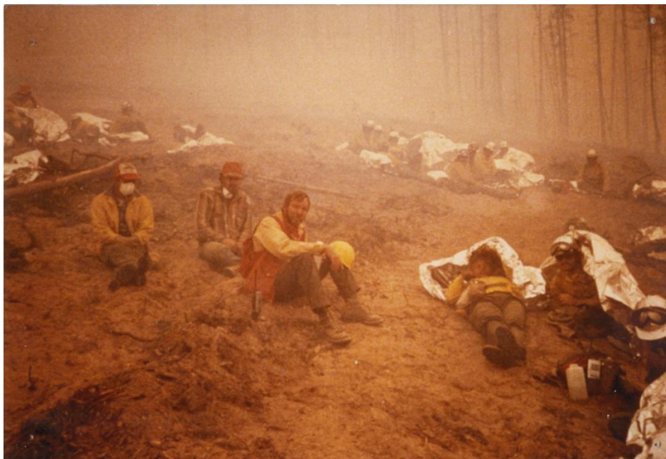
Firefighters emerge from their fire shelters after the fire passed over the safety zone.